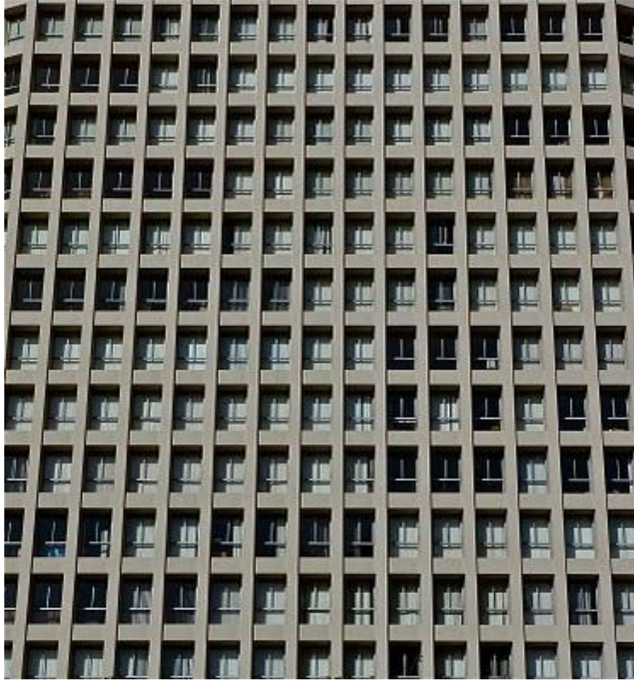
Photograph [1] “Apartment House”